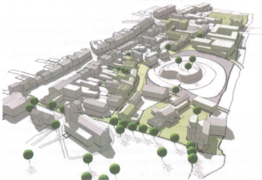
Figure 5.1 View over the area from the east, showing possible development form