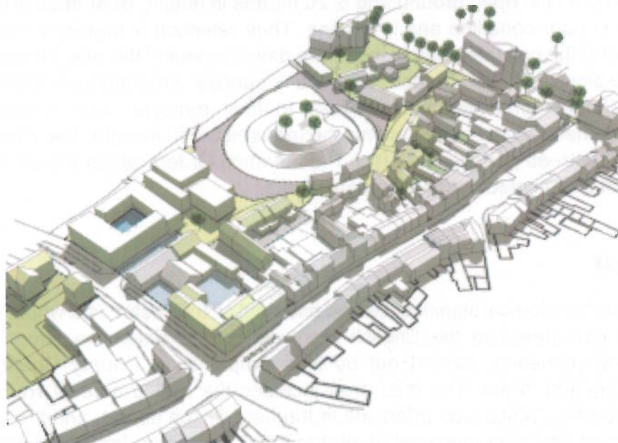
Figure 5.2 View over the area from the north, showing possible development form